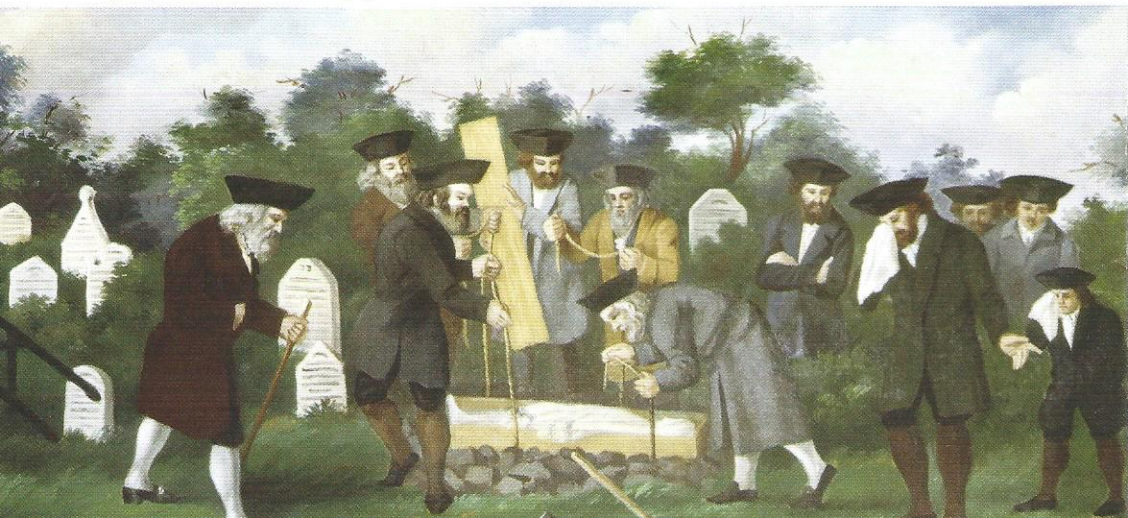
Funeral group at burial in cemetery

JJBS has an up-to-date, fully-equipped facility for carrying out taharah at Cheshunt and now has its own chevra kadisha , made up of volunteers from member synagogues, to prepare the bodies of those who have passed away. If you would be interested in learning more about this mitzvah please contact your synagogue administrator or the JJBS office (contact details below).