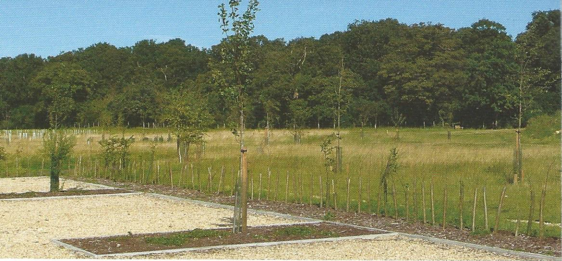
The first trees begin to grow at the woodland cemetery

There are various extras and additional services, which are not covered by the scheme. To find a full list of what is and what is not included, as well as the related charges, please visit the JJBS website ( www.jjbs.org.uk ) or contact the JJBS office.